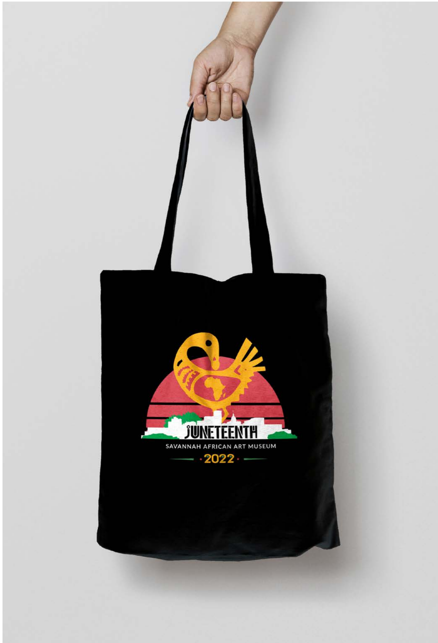
SAAM Tote Bag | illustrator