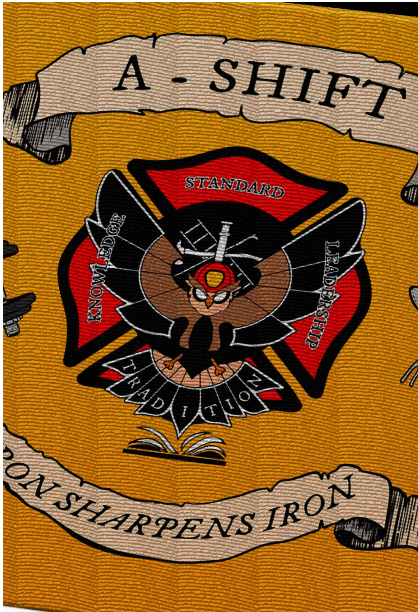
A-Shift Logo Design 01 | illustrator