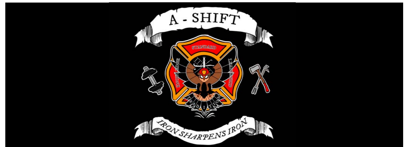
A-Shift Logo Design 02 | illustrator