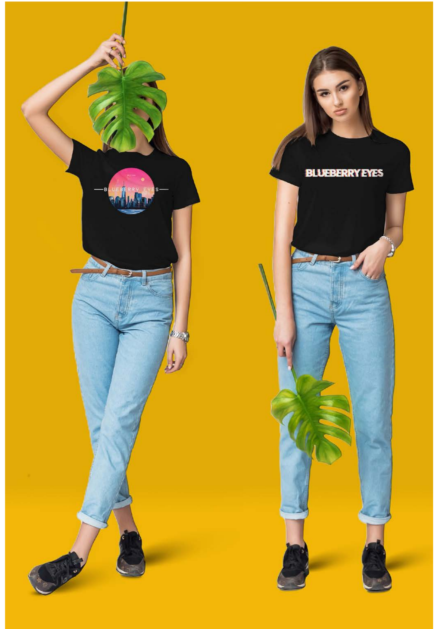
Blueberry Eyes Apparel Design | photoshop + illustrator